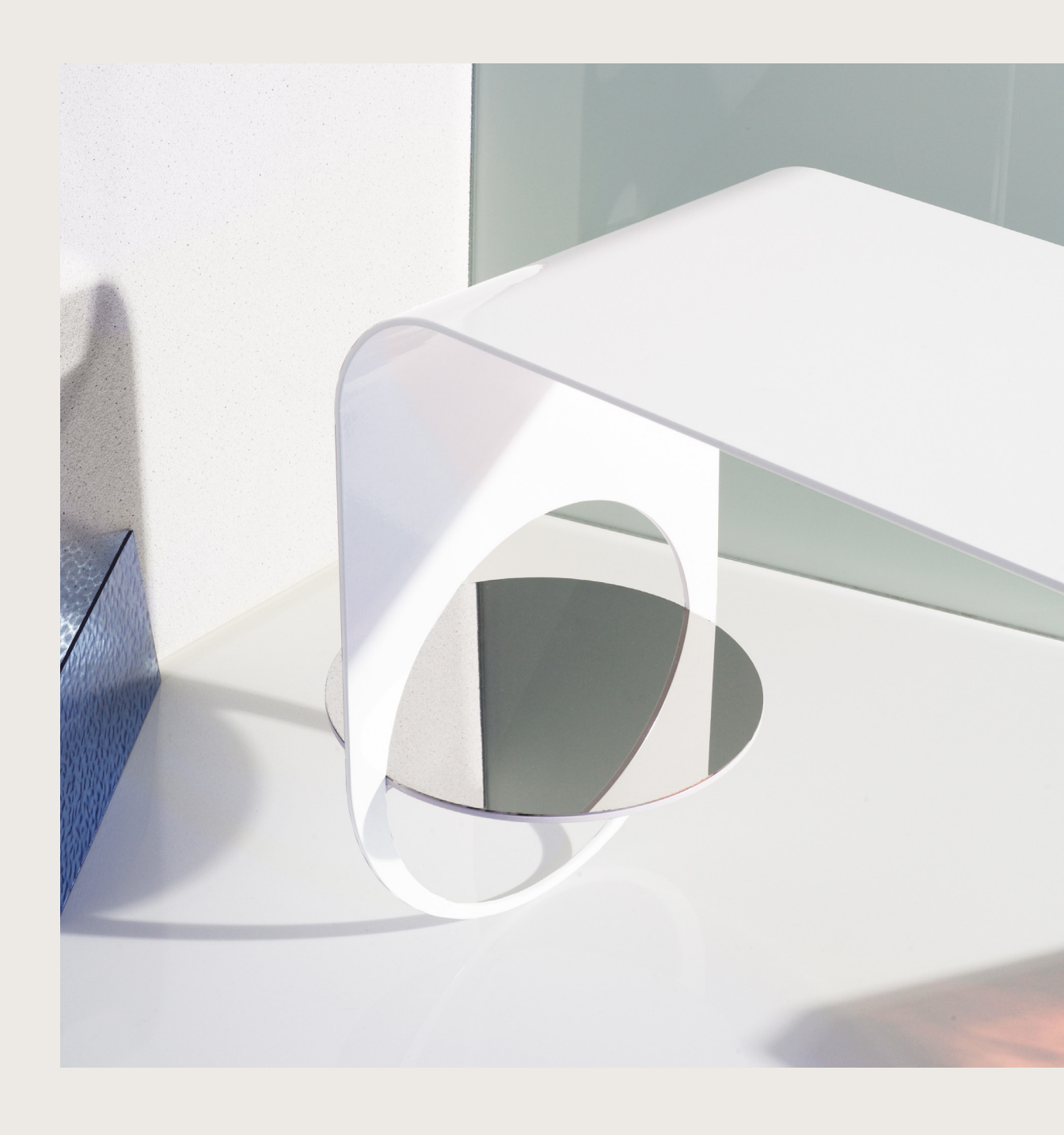
>>> KIN & COMPANY (((