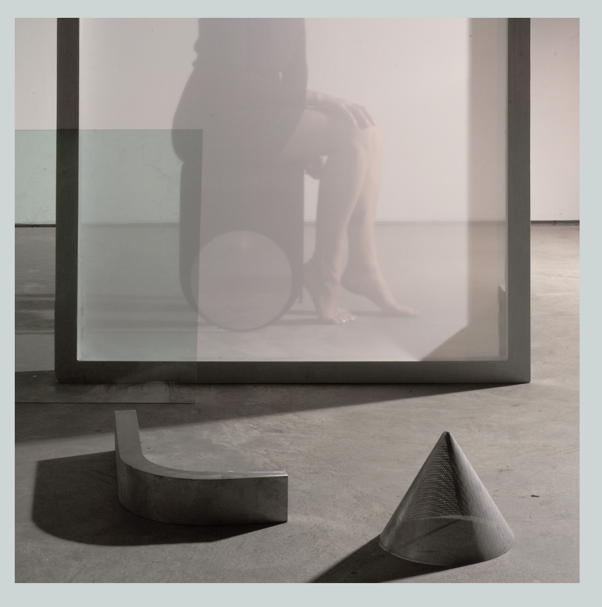
Thin Table 1